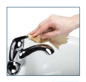
USE PAPER to shut the tap